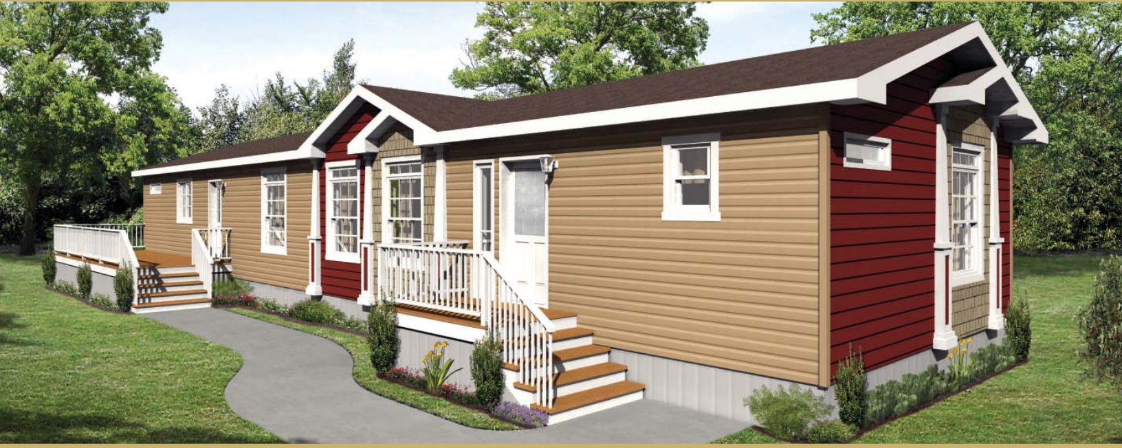
MODEL 20720 - 3 BED / 2 BATH - 20' x 76' 1520 SQ.FT.